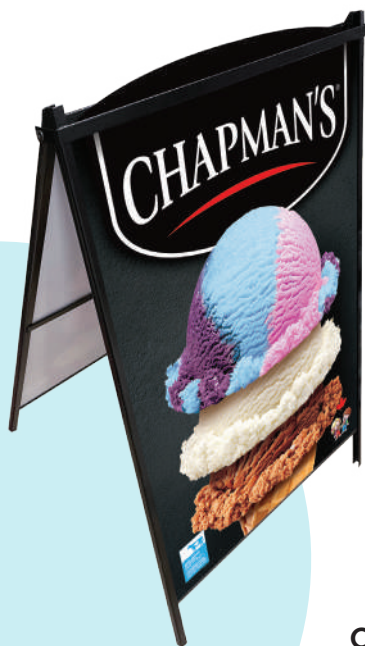
A-FRAME SIGNS 37.5" H x 23.75" W 4 mm coroplast