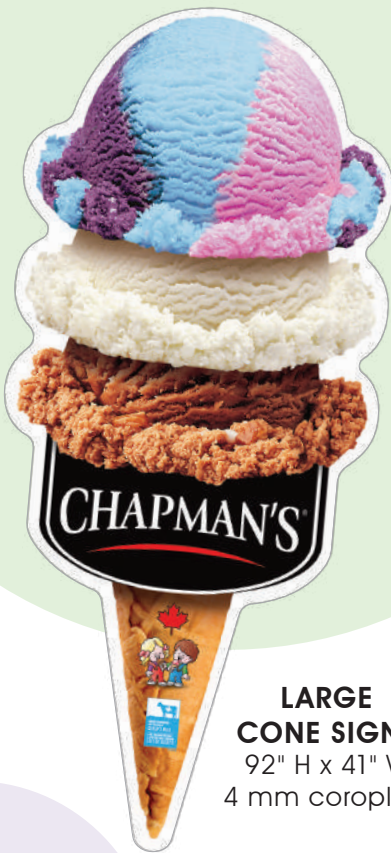
LARGE CONE SIGNS 92" H x 41" W 4 mm coroplast