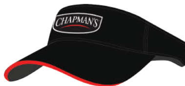
ADULT VISORS Brushed heavy cotton