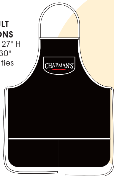
ADULT APRONS 24" W x 27" H with 30" white ties