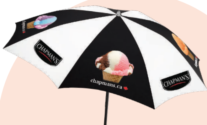
PATIO UMBRELLAS 72" arc, 6.5' tall

POS is available through your Chapman's Ice Cream supplier