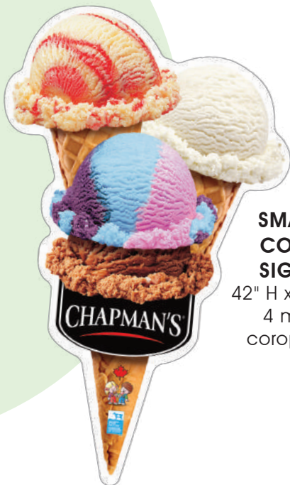
SMALL CONE SIGNS 42" H x 26" W 4 mm coroplast