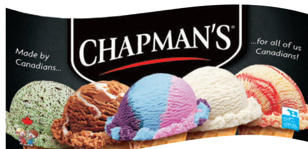
VINYL BANNER , 24" H x 48" W, 13 oz vinyl Hemmed with 4 hanging grommets