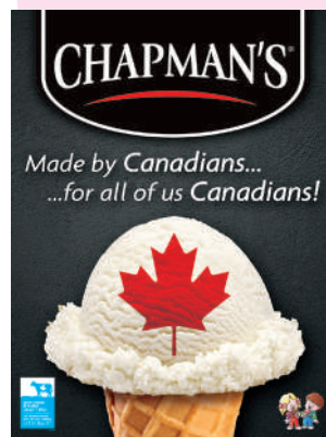
TRIPLE SCOOP POSTER CANADIAN CONE POSTER 24" H x 18" W, 4 pt card