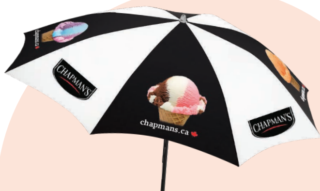
PATIO UMBRELLAS 72" arc, 6.5' tall

POS is available through your Chapman's Ice Cream supplier