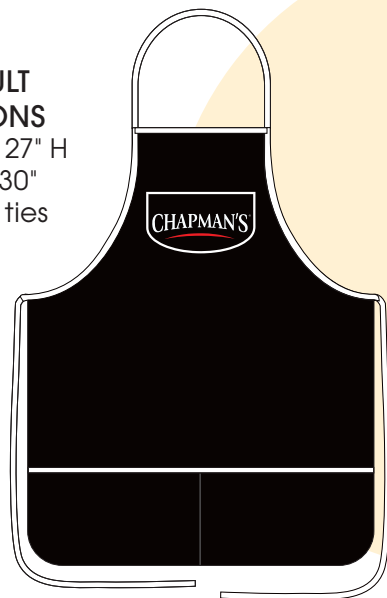
ADULT APRONS 24" W x 27" H with 30" white ties