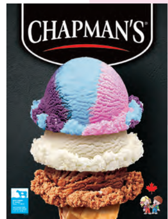
POSTER, 24" H x 18" W, 4 pt card