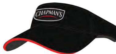
ADULT VISORS Brushed heavy cotton