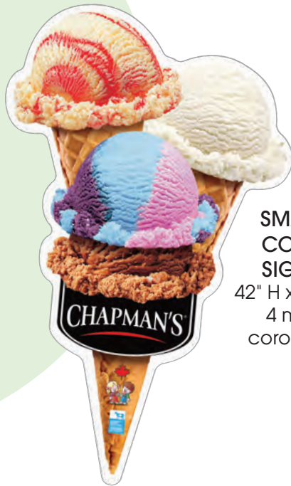
SMALL CONE SIGNS 42" H x 26" W 4 mm coroplast