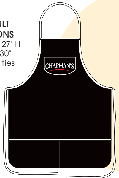
ADULT APRONS 24" W x 27" H with 30" white ties