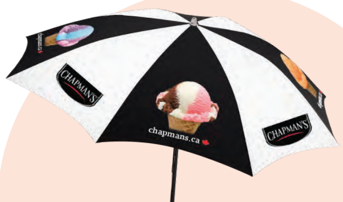
PATIO UMBRELLAS 72" arc, 6.5' tall

POS is available through your Chapman's Ice Cream supplier